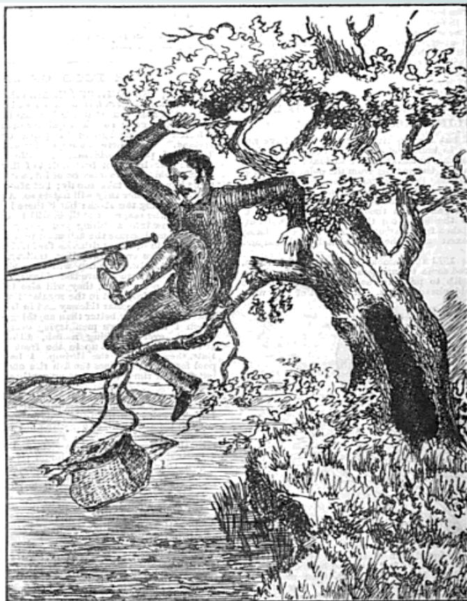
Sketch of a hapless fisherman from 1886 issue of Fishing, Fish Culture & The Aquarium

November 16-18, 2012 4th Annual Myrtle Beach Antique Fishing Tackle Show Myrtle Beach, SC